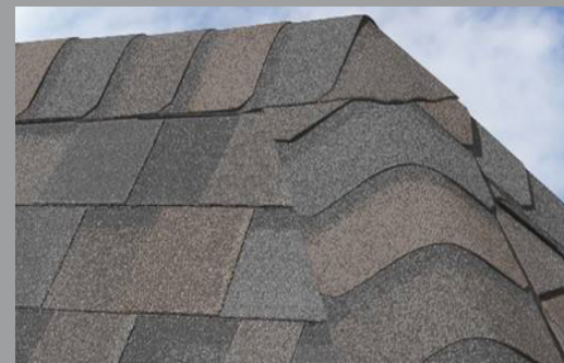
RIDGE AND HIP SHINGLES

A ridge vent is a type of vent installed at the peak of a sloped roof on some homes which allows warm, humid air to escape a home /building's attic.